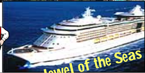
Jewel of the Seas

This cruise is on nearly everyone's Must-Do list, and for good reasons. Let's plan ahead, and create a nice-sized group. That will keep our costs down and our enjoyment up! Prices are pp based on double, and include Port Charges & Taxes. Airfare, Transfers, Hotel additional. Call for pricing. Travel Insurance is recommended, and will be offered at time of deposit. Prices subject to increase unless paid in full. Deposit of $500 pp (of which $150 is non-refundable) due 15 Mar 2010. Final payment 10 Apr 2010.